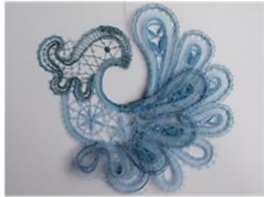
Figure 2. Making lace following a model