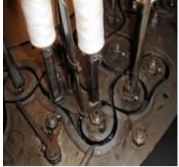
Figure 4. Mechanism detail – grooves and paths of bobbins with thread