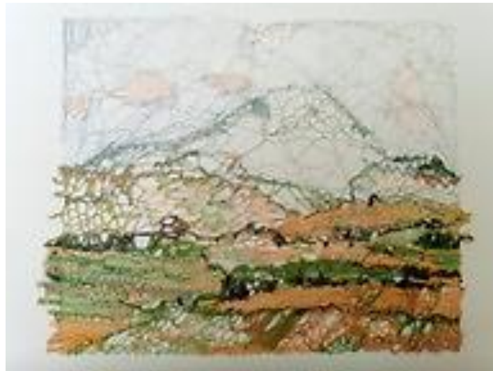
Figure 8. A painting by Paul Cézanne rendered in lace, B. Pisancheva