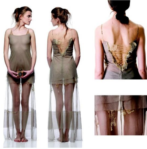
Figure 9. Models by Lydia Suteva