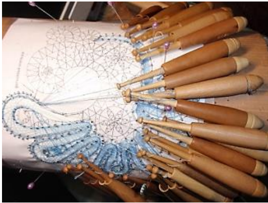
Figure 3. Model of a bird, rendered by B. Pisancheva