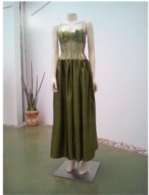
Figure 7. Yong Wheat dress, B. Pisancheva