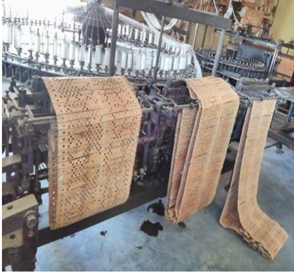
Figure 5. Lacemaking mechanism with punctured cards