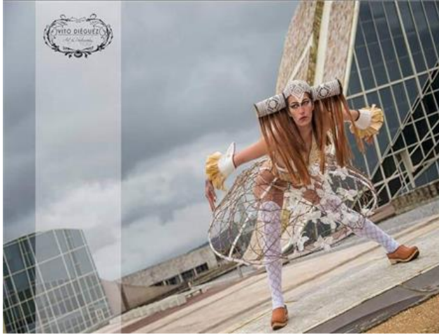
Figure 8. A model by Jose Luis Luaces