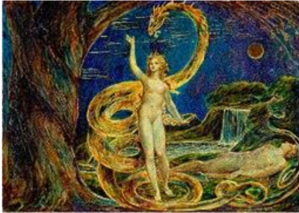
Figure 3. Eve Tempted by the Serpent. 1799-1800