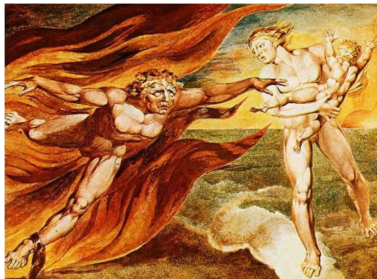
Figure 6. The Good and Evil Angels, cca. 1790