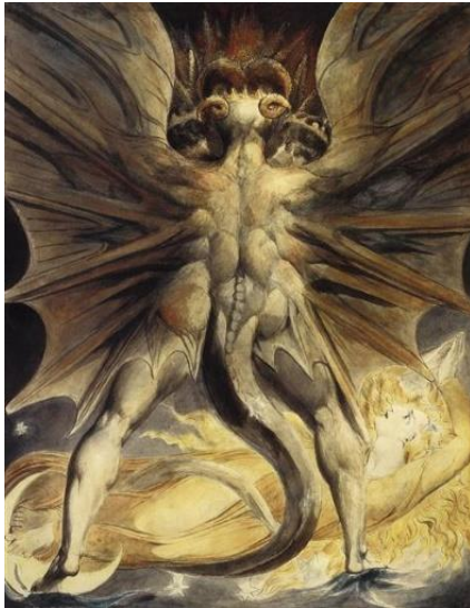
Figure 5. The Red Dragon and the Woman Clothed with the Sun. 1805-10