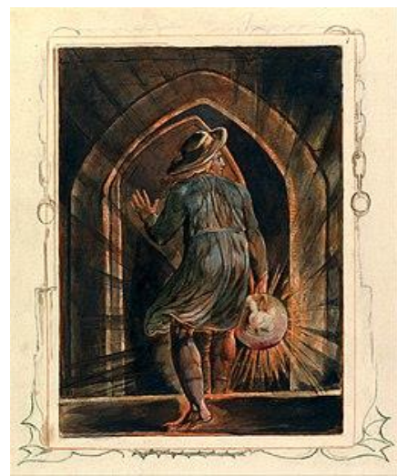
Figure 2. Frontispiece to Jerusalem . 1804-20