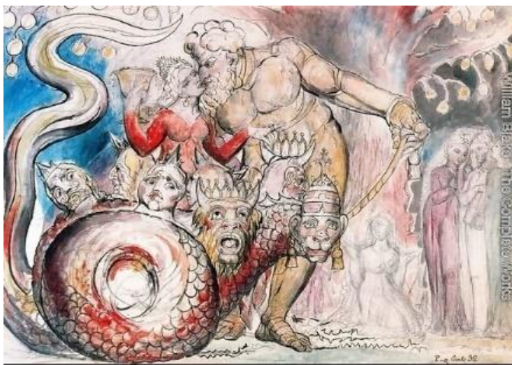
Figure 1. The Harlot and the Giant . 1824-27