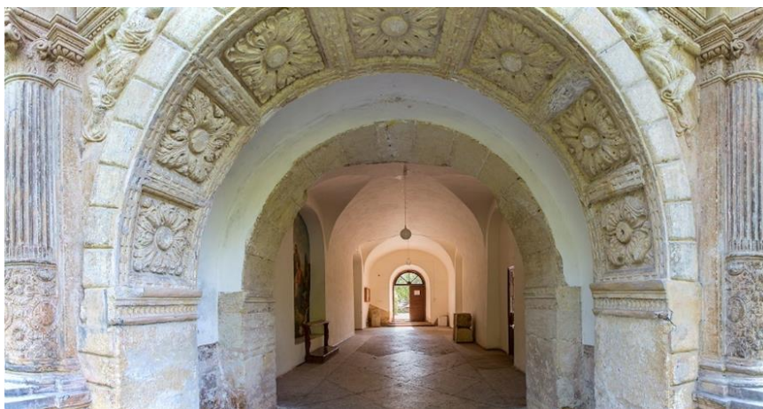
Figure 4. Through passage, view from the west.