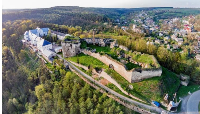
Figure 2. Yazlovets Castle (foreground) and the palace (on the left), view from the southeast.