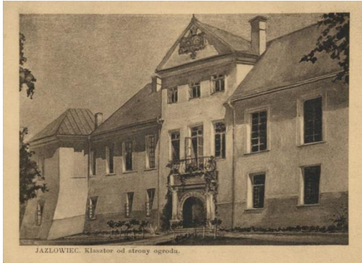
Figure 1. West facade of the palace, photo of 1939 from the archives of the Ternopil Regional Department of Construction and Architecture