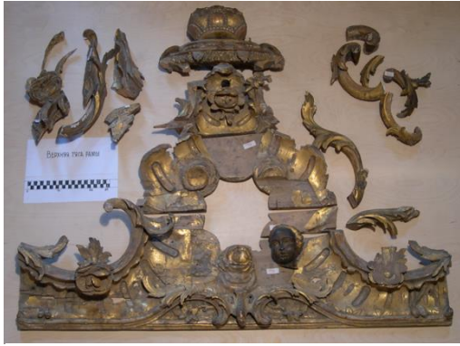
Figure 9. The upper listel of the frame to the temple icon Nicholas the Wonderworker in Life before the restoration of the foundation was lost in the process of identifying their historical places in the composition of the upper leaflet of the frame