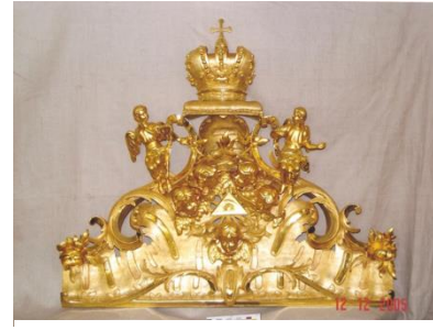
Figure 41. The upper listel of the frame to the temple icon Mikhbail Malein and John the Warrior after the restoration of the loss of carved and sculptural decoration, local recreation of the levkas and locally decorative gilding: glossy on a polymer and matte, with tinted restoration gilding to match the color of the preserved historical