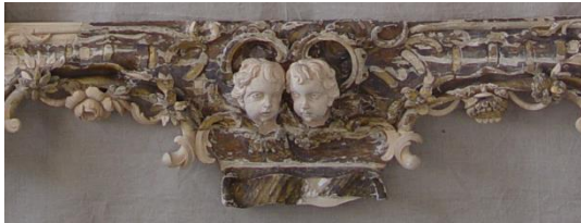
Figure 14. The lower listel of the frame to the temple icon Nicholas the Wonderworker in Life after the preservation of the historical runt before the removal of persistent surface contamination, after the restoration of the loss of carved sculptural and ornamental decor in linden wood