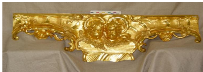
Figure 16. The lower listel of the frame to the temple icon Nicholas the Wonderworker in Life after a full complex of conservation and restoration work