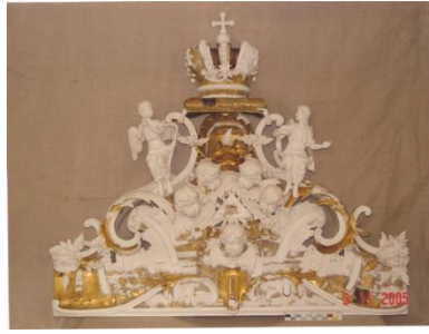
Figure 40. The upper listel of the frame to the temple icon Mikhbail Malein and John the Warrior after the restoration of the loss of carved and sculptural decoration, preservation of the historical ground with gilding, local reconstruction of the lost ground-levkas