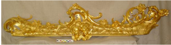
Figure 22. The left listel of the frame to the temple icon Nicholas the Wonderworker in Life after the preservation of the historical levkas, the local reconstruction of its losses and the local reconstruction of decorative gilding of two types