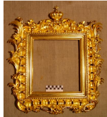
Figure 32. The execution of glossy gilding on the polymer and matte on the codpiece, followed by toning of the restoration gilding on the recreated frame to the image of Nicholas the Wonderworker of the 17th century to match the color of the icon Nicholas the Wonderworker in Life preserved on the large frame