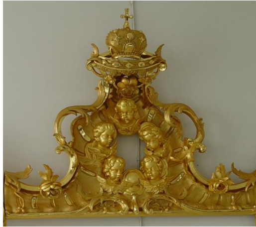
Figure 13. The upper listel of the frame to the temple icon Nicholas the Wonderworker in Life after performing a full range of conservation and restoration work