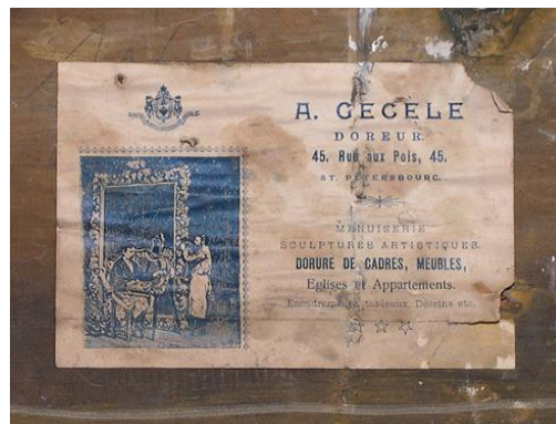
Figure 19. The label of the company A. Jessel, discovered during the restoration of the frame to the temple icon Nicholas the Wonderworker in Life in 2004