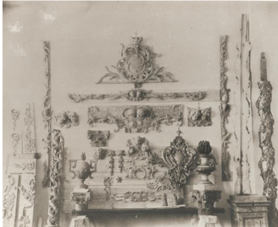
Figure 5. Details of the frames for the temple icons and the altar Canopy of the Sampson Cathedral in the process of restoration in the workshop of A. Zheselya. 1908.