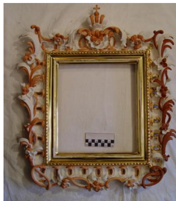
Figure 30. Reconstruction of the ground-levkas on the recreated frame to the image of Nicholas the Wonderworker of the 17th century. Application of primer-polymer to the places of glossy gilding