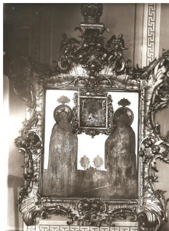
Figure 7. The frame and the temple icon Mikhail Malein and John the Warrior of the Sampson Cathedral before the restoration of 1909.