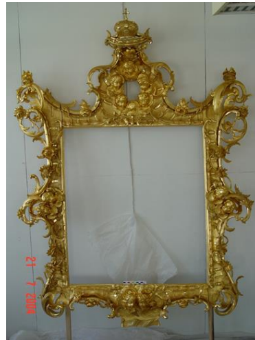
Figure 26. General view of the frame for the temple icon Nicholas the Wonderworker in Life in the assembly after a comprehensive restoration of the base and decorative decoration in the form of gilding