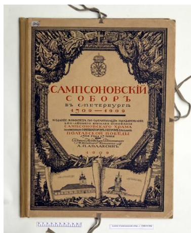
Figure 3. Anniversary album about the restoration of the Sampson Cathedral in 1908-1909, published for the 200th anniversary of the Victory in the Battle of Poltava in 1709