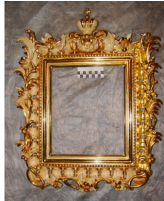
Figure 31. The execution of glossy gilding on a polymer on a recreated frame to the image of Nicholas the Wonderworker of the 17th century and the coating of areas of future matte gilding with alcohol shellac varnish