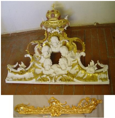
Figure 11. The upper listel of the frame to the temple icon "Nicholas the Wonderworker in life during restoration: local reconstruction of the loss of levkas and removal of persistent surface contamination with preservation and preservation of the historical gilding of 1909