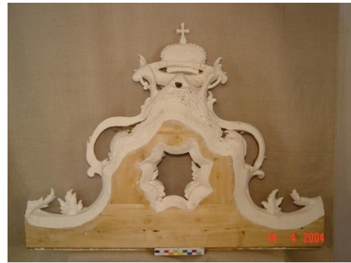
Figure 12. The back side of the upper leaf of the frame of the temple icon Nicholas the Wonderworker in Life in the process of dubbing historical fragments on a new basis and the process of recreating the lost ground-levkas