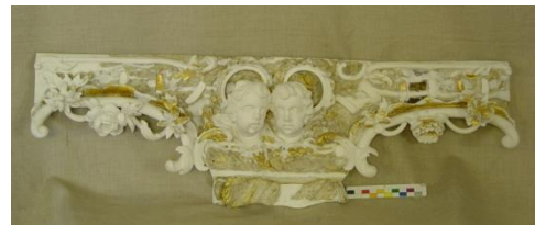
Figure 15. The lower listel of the frame to the temple icon Nicholas the Wonderworker in Life after the preservation of the historical runt, local replenishment of its losses and removal of persistent surface contamination