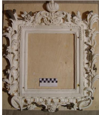
Figure 28. The transfer of the model from soft material to plaster to continue working in the authentic material of the monument – the wood of the linden tree