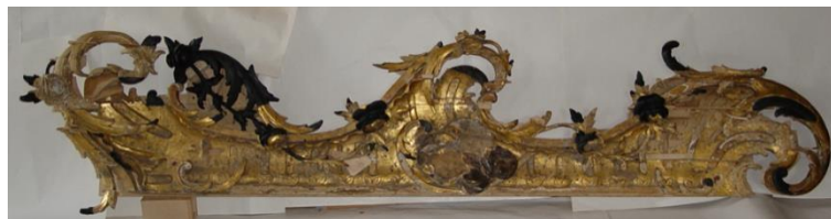
Figure 43. The left listel of the frame to the icon Mikhbail Malein and John the Warrior in the process of modeling the loss of carved and ornamental decor