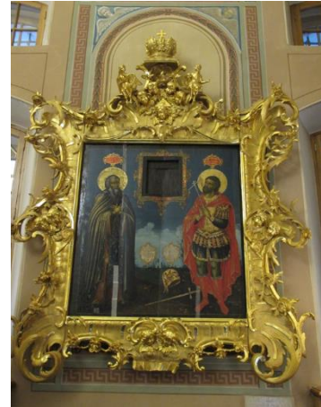
Figure 46. General view of the temple icon Mikhail Malein and John the Warrior in the frame after a comprehensive restoration of carved ornamental and sculptural decor with restored gilding of two types