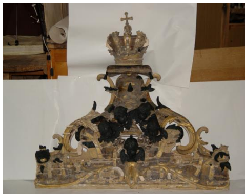
Figure 36. The upper listel of the frame to the temple icon Mikhail Malein and John the Warrior before the restoration of the losses of carved and sculptural decor with losses made up in soft material-plasticine