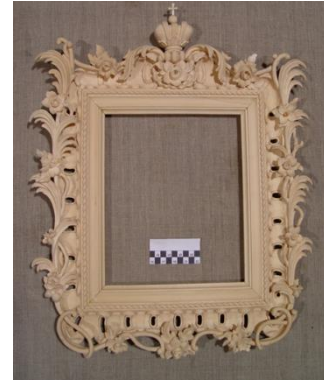
Figure 29. Execution of the frame to the image of Nicholas the Wonderworker of the 17th century according to the model in the authentic material of the monument – the wood of the linden tree