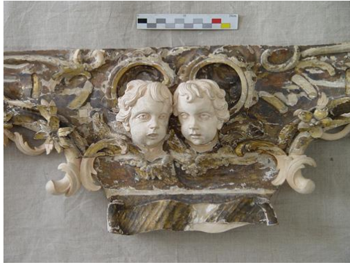
Figure 17. The fragment is the center of the lower listel of the frame to the temple icon Nicholas the Wonderworker in Life after the preservation of historical levkas and gilding, after the restoration of the loss of ornamental and sculptural wood carving