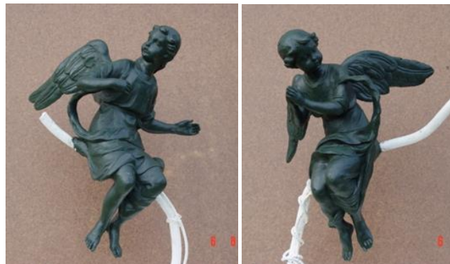
Figure 37-38. Reconstruction based on a photograph of two sculptures of angels made in a soft material-plasticine for the upper listel of the frame for the temple icon Mikhail Malein and John the Warrior