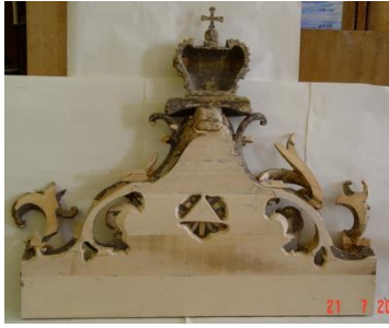
Figure 39. The backside of the upper listel of the frame to the temple icon Mikhbail Malein and John the Warrior after duplicating the original carving of the 18th century on a new foundation