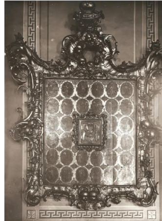
Figure 6. The frame and the temple icon Nicholas the Wonderworker in the Life of the Sampson Cathedral after the restoration of 1909.