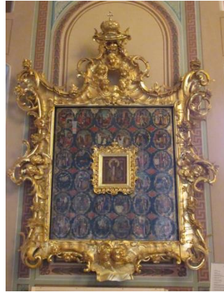
Figure 34. The frame for the temple icon after a comprehensive restoration of the base and decoration in the form of decorative combined gilding and reconstruction of the lost frame to the image of Nicholas the Wonderworker of the 17th century