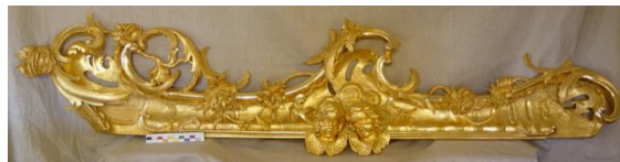
Figure 24. The right leaflet of the frame to the temple icon St. Nicholas the Wonderworker in Life after the preservation of the historical gilt frame, local soil replenishment, the restoration of two types of gilding and tinting of the restoration gilding to match the color of the preserved historical