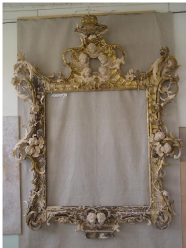
Figure 25. General view of the frame for the temple icon Nicholas the Wonderworker in Life in the assembly after a comprehensive restoration of the foundation and the reconstruction of ornamental and sculptural decor. preservation of historical levkas with gilding and partial clearing of the surface of historical gilding from strong persistent surface contamination