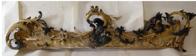
Figure 42. The left listel of the frame to the icon Mikhbail Malein and John the Warrior in the process of modeling the loss of carved and ornamental decor