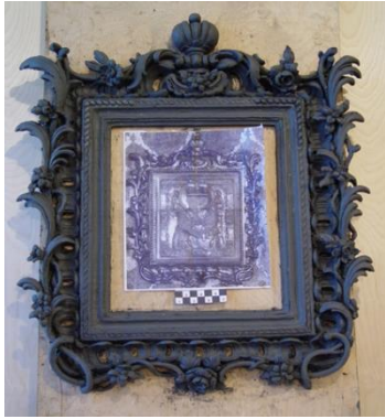
Figure 27. Reconstruction of the lost small frame to the image of Nicholas the Wonderworker of the 17th century based on the photograph of K.K. Bulla in 1909. Execution of the model in a soft material