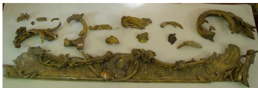
Figure 20. The left listel of the frame to the temple icon Nicholas the Wonderworker in Life before the restoration of the base loss with characteristic strong persistent surface contamination of the base and historical gilding when identifying the loss of the composition