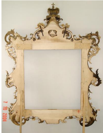
Figure 44. General view of the backside of the frame to the temple icon Mikhail Malein and John the Warrior in the process of duplicating the base and dry assembly of the frame