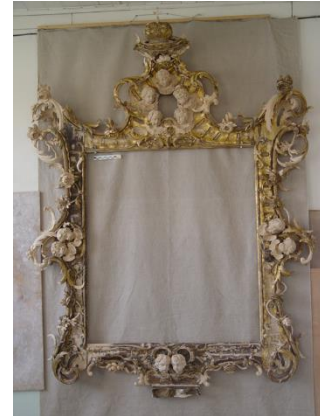
Figure 35. General view of the frontside of the frame to the temple icon Mikhail Malein and John the Warrior in the process of assembly after conservation and reconstruction of sculptural and ornamental decor