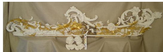
Figure 21. The left listel of the frame to the temple icon Nicholas the Wonderworker in Life in the process of preserving the historical levkas and local reconstruction of its losses with the control clearing of the surface from intense persistent contamination (in the center) from the historical gilding of 1909