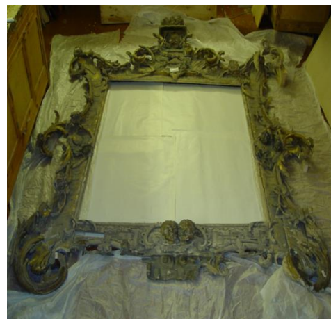
Figure 8. The frame for the icon Nicholas the Wonderworker in Life before the restoration of the foundation in the process of disassembling the disparate elements of the frame and identifying their historical places in the composition in the restoration workshop of wood carvers