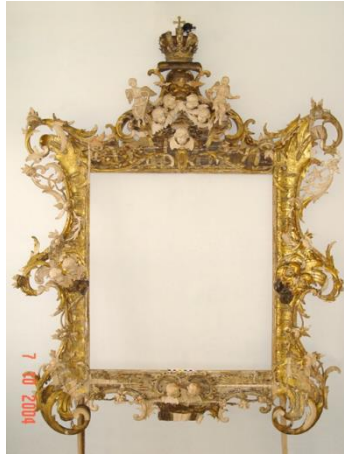
Figure 45. General view of the frontside of the frame to the temple icon Mikhail Malein and John the Warrior in the process of restoration - restoration of carved and sculptural decor and preservation of the historical levkas with gilding in 1909