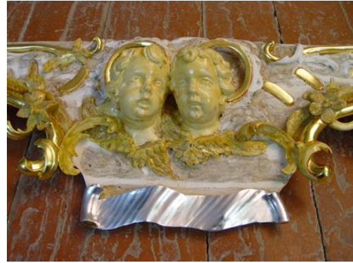
Figure 18. The fragment is the center of the lower listel of the frame to the temple icon Nicholas the Wonderworker in Life in the process of recreating the decorative decoration with a silver gilt lining on the ribbon, as an analogue of the historical decoration