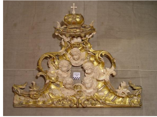
Figure 10. The upper listel of the frame to the temple icon Nicholas the Wonderworker in Life after recreating the loss of sculptural and ornamental decor in the authentic material of the monument – linden wood