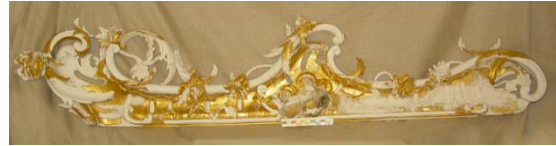
Figure 23. The right listel of the frame to the temple icon Nicholas the Wonderworker in Life in the process of preserving the historical levkas and local reconstruction of its losses, with clearing the surface of persistent contamination of historical gilding