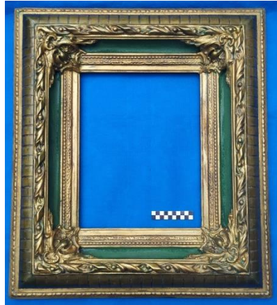
Figure 5. General view of the front side of the frame after restoration