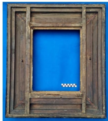
Figure 2. General view of the back of the frame after restoration