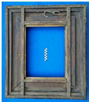
Figure 1. General view of the back of the frame before restoration