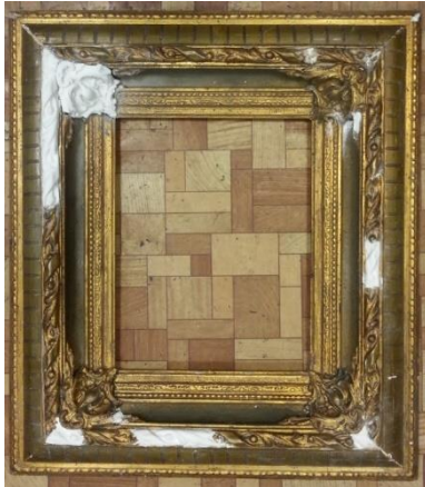
Figure 4. General view of the frame during restoration: reconstruction of local losses of stucco decoration