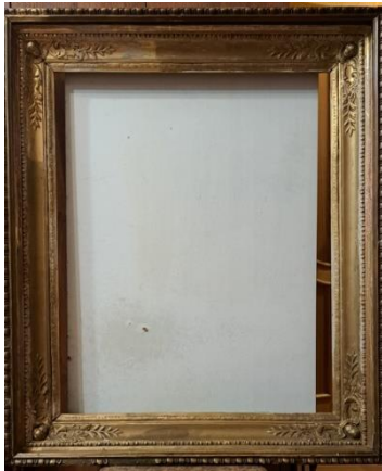
Figure 1. General kiot view with uneven bronze paints before restoration with control surface cleaning before decorative finishing of the author's layer