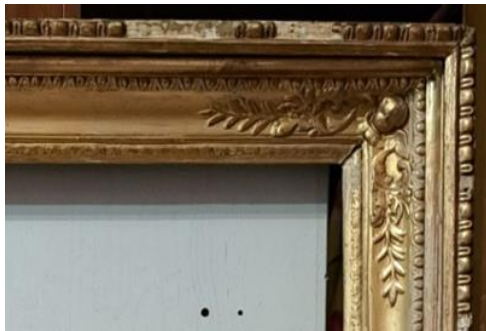
Figure 8. The kiot frame fragment after removing solid bronze paintwork before restoring the wooden base and installing the missing mastic fragments at the places of their loss