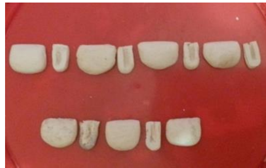
Figure 9. Reconstruction of local losses of mastic decor by hand and subsequent drying of fragments