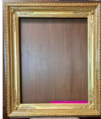
Figure 21. The front side of both kiot frames after a comprehensive restoration of the base, the loss of stucco decoration and gilding of two types