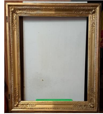
Figure 7. The half-clearing of the icon frame from the late bronze paintwork and the revealed state of preservation of the author's decoration