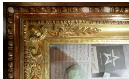
Figure 11. Reconstruction of local losses of mastic decor in the left part of the door frame. Installation of recreated mastic decor fragments at the place of local losses of the author's decor