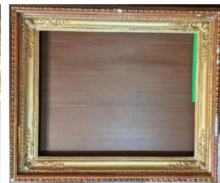
Figure 12. Recreating local mastic decor losses on the outer door frame