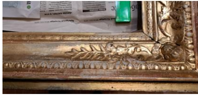
Figure 13. The icon frame fragment before the restoration of gilding in the severe scuffing area of gilding of two types: glossy and matte