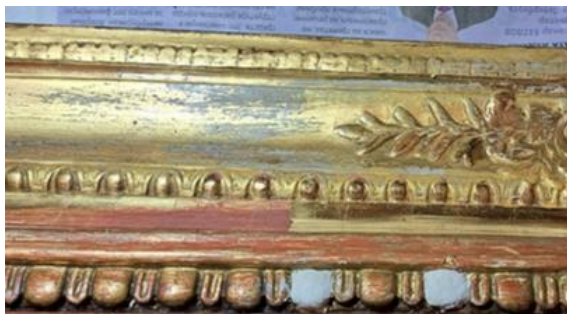
Figure 18. Scuffs on matte gilding areas on a large listel before tinting at the loss sites