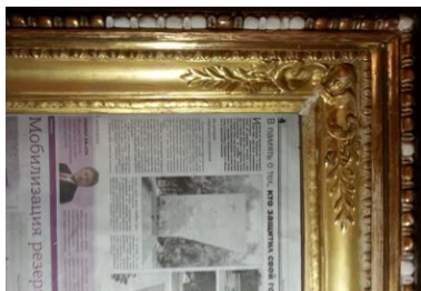
Figure 10. Reconstruction of local mastic decor losses in the upper part of the door frame and mastication of frame joints in the corners of the icon frame