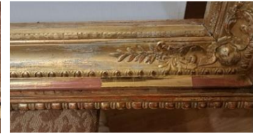
Figure 15. Trial gilding on the polymer on the outer listel of the inner icon frame in the severe abrasion area (right). The icon frame fragment with polished gold on the outer frame pull