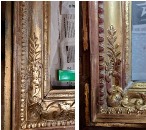
Figure 16. The author's gilding scuffs on the cut of the egg-end-darts and the polymer application for trial egg-end-dart gilding on the inner kiot frame