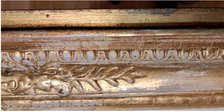
Figure 6. Defects of the author's gilding of two types in the form of strong scuffs of glossy and matte gilding, revealed under the bronze paints on the surface of the author's frame finishing