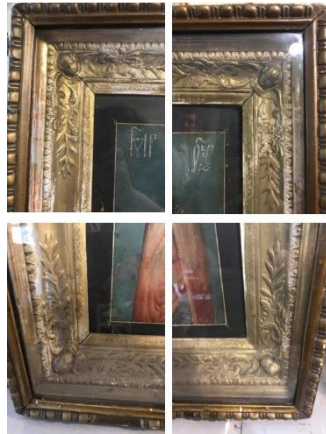
Figure 2. Fragments of the kiosk before the complex restoration. Distortions of the finishing of two kiot frames with bronze paints and subsequent washings of the author's gilding