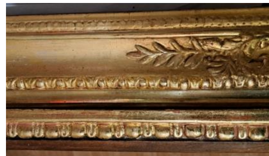
Figure 19. Tinting of matte gilding scuff areas on matte gilding loss areas and glossy gilding restoration on the door frame egg-end-darts