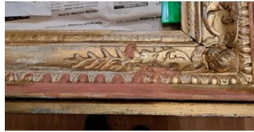
Figure 14. The icon frame fragment with a primer polymer applied to the upcoming glossy gilding areas