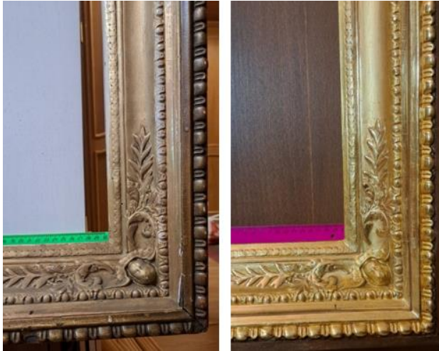
Figure 20. The lower right kiot corner before and after the restoration of two types of gilding