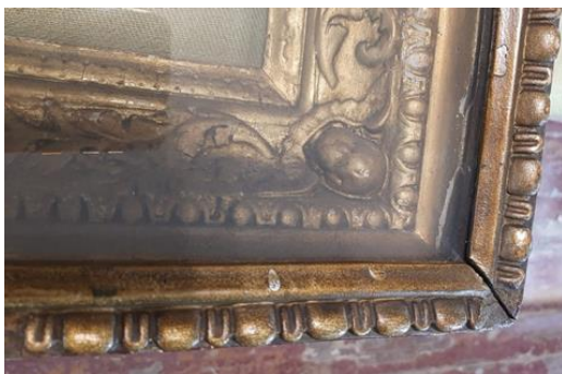
Figure 4. Surface contamination, ruptures of the base of the kiot by "mustache" connections, loss of the author's levkas (bottom right)