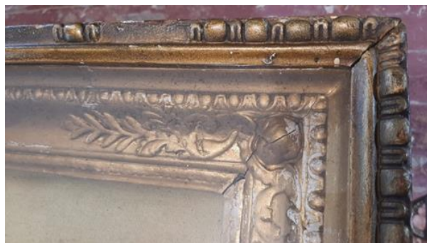
Figure 5. The loss of the mastic stucco decoration of the egg-and-darts on the outer frame-door and the divergence of the "moustache" joints of both frames in the corners