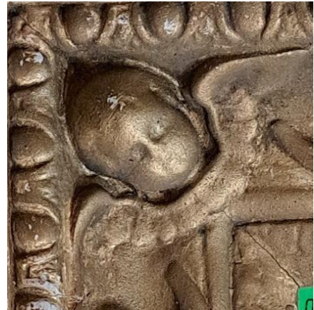
Figure 3. A fragment of a frame with a cherub's head with unprocessed details of mastic molding